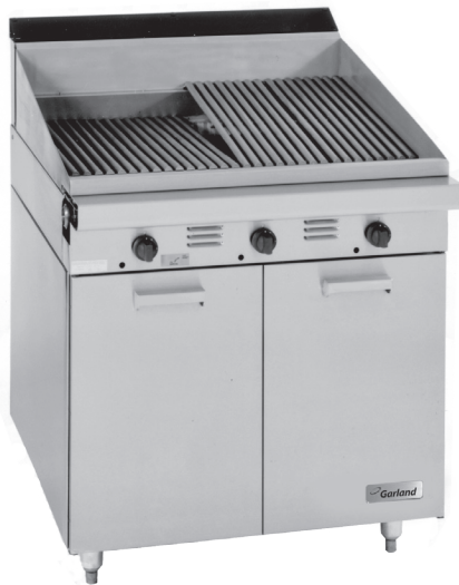
Model M34B (valve control panel not as depicted)