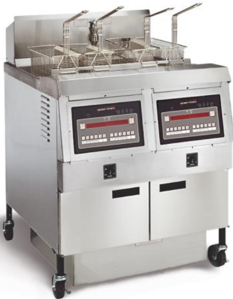
OFG 322 2-well gas open fryer with Computron™ 8000 control

Henny Penny open fryers offer high-volume, integral multi-well frying with programmable operation, oil management functions and fast, easy filtration.