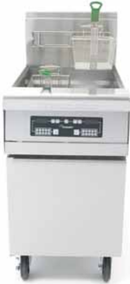
Shown with optional electronic timer controller and casters