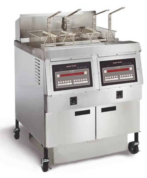
OFG 322 2-well gas open fryer with Computron™ 8000 control